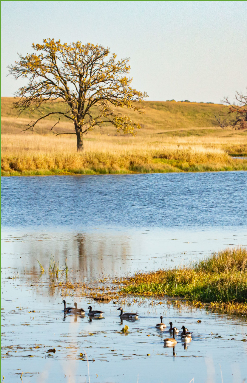
Keystone Woods WMA, Washington County