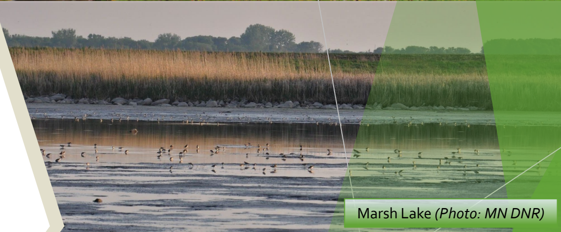
Marsh Lake