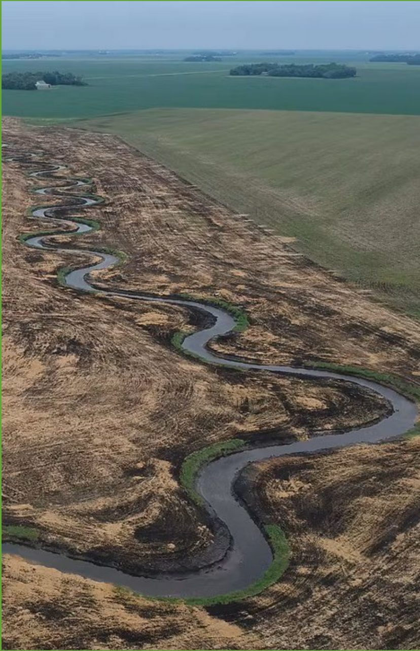
Whiskey Creek Restoration, Clay County