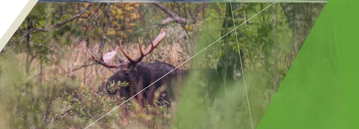
Moose on OHF site, Cook County